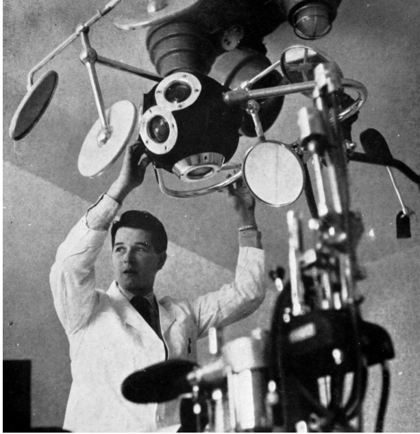
Operating room